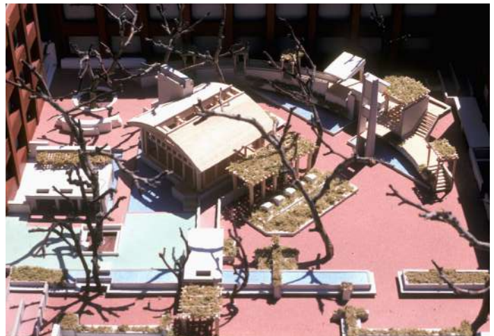
DuSable Urban Ecology Sanctuary

An abundance of evidence supports how healing environments create efficiency across health systems and promotes well-being. In an effort to promote health equity, the time is now to integrate architecture and health in an effort to promote and sustain well-being for all across the lifespan. As evidence, the Department of Veteran Affairs has created a Healing Environment Design Guideline to create efficiencies for the healing of the mind, body and spirit of nine million Veterans and their families. The Healing Environment Design Guideline will direct the design and construction for all VA medical centers, outpatient clinics and long-term living facilities.