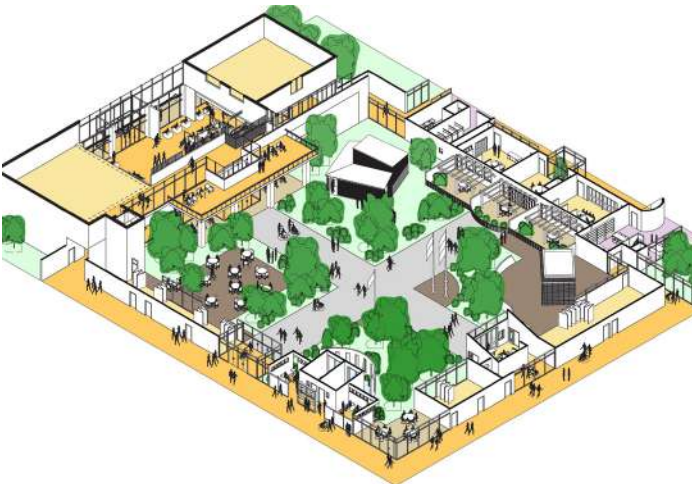
VAHEDG Courtyard Diagram