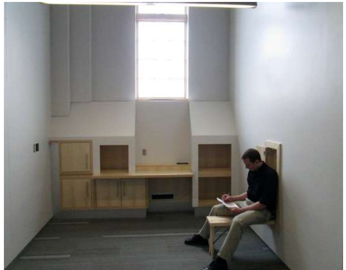
Veterans Memorial Building - Behavioral Health Room